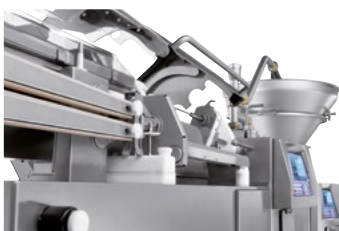
↑ Length unit

With Voiding mode, the filling process runs continuously. The voider defines the exact linking position and, in conjunction with highly-dynamic linking, facilitates portioning accurate to the gram with constant lengths.