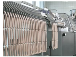
↑ Hanging unit

The FPVLH 242 places the linked sausages as straight or curved portions, with the linking position exactly on the hanging unit's hook. The number of loops and number of portions per loop may be chosen at will. A narrow hook pattern ensures optimum smoke stick loading and therefore smoking and cooking systems are fully utilised, resulting in cost and energy savings. Rationalisation and efficiency are guaranteed thanks to this continuous, uniform overall process.