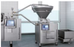
↑ Tubing to VF 611

The monitor control system in the FPVLH 242 controls the integrated vane cell feed system and the modular function units for portioning, voiding equal lengths and hanging. High effective performance is therefore achieved for peel-off and collagen casing sausages. The VF 611 and VF 631 for straight filling are the perfect filling pumps for the FPVLH 242. With permanent pressure and constant filling flow, along with a high vacuum output, they provide optimum feeding for gentle processing of cooked and boiled sausage types and smear-free products. The VF 611 is ideally suited for connection of one FPVLH 242, and the high-performance VF 631 for connection of two FPVLH 242 units.