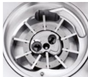
↑ Vane cell feed system