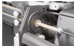
↑ Automatic casing spooling of artificial and collagen casing