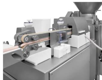
↑ Processing in horizontal position