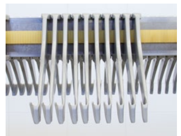
↑ New hook spacing 20 mm