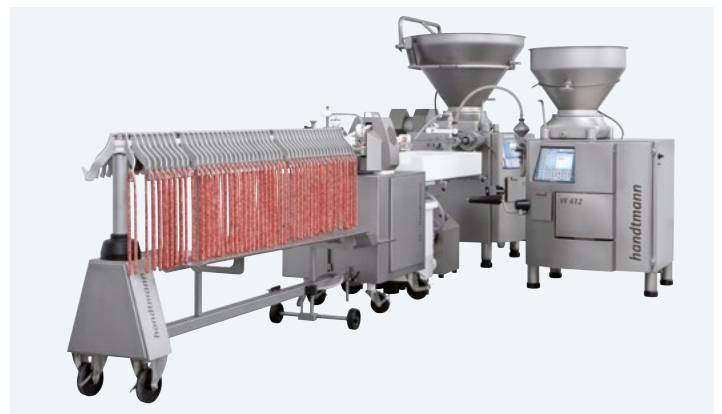
↑ ConPro-Link with hanging unit

Virtual Patent Marking: www.handtmann.com/patents-mf