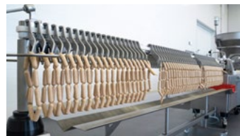
↑ Hanging unit

The PVLH 228 plus places the linked sausages as straight or curved portions, with the linking position exactly on the hanging unit's hook. The number of loops and of portions per loop may be chosen at will. A narrow hook pattern ensures optimum smoke stick loading and therefore full utilisation of smoking and cooking systems, resulting in cost and energy savings.