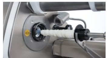
↑ Optical casing end sensor